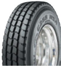
G288 MSA° DuraSeal™

Also available without DuraSeal Technology®