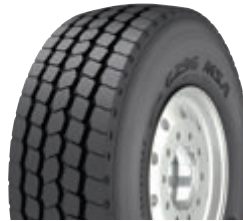
G296™ MSA DuraSeal™

Also available without DuraSeal Technology®