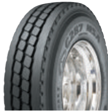
G287 MSA° DuraSeal™

Also available without DuraSeal Technology®